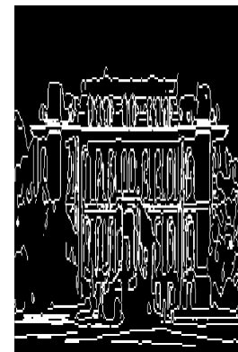
Fig 5 : Fusion