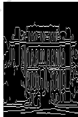
Fig 4 : using Roberts