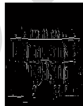
Fig 3 : using Prewitt