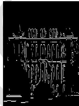
Fig 2 : using Sobel